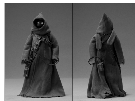
Finished view (front and back)