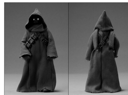
Finished view (front and back)