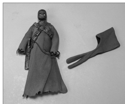
OPTION 1: Start with curved side of hood

To enable the light-up eyes feature, turn switch (located on backside of head) to the right 'ON' position. To replace batteries, unscrew the cover.