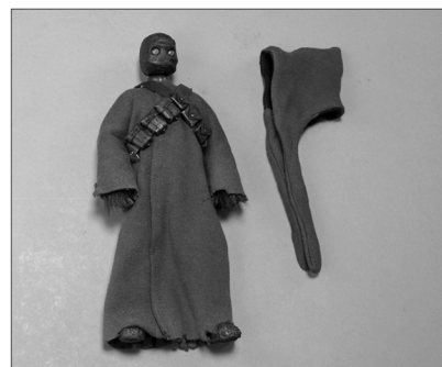
OPTION 2: Start with straight side of hood