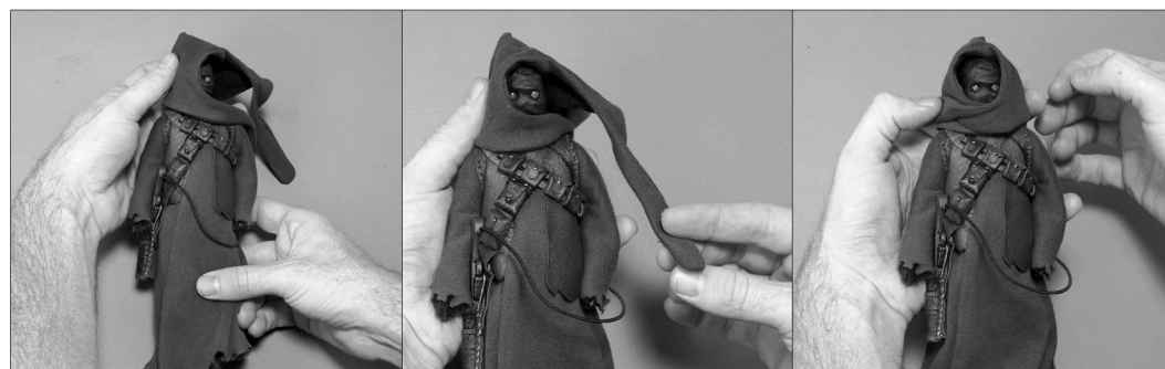
Place hood on figure bringing the hood's flaps to the front of the figure then overlap/cross flaps over the mouth area and wrap around to the back.