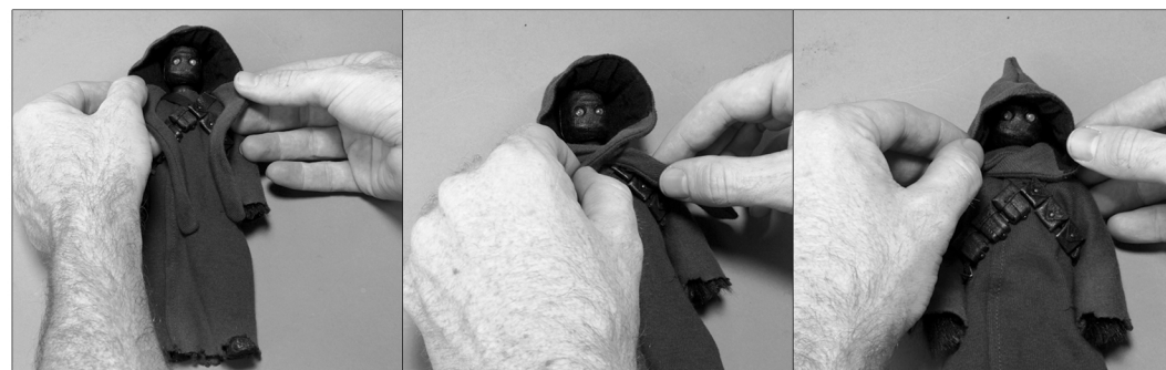
Place hood on figure bringing the hood's flaps to the front of the figure then overlap/cross flaps over neck areas and wrap around to the back.