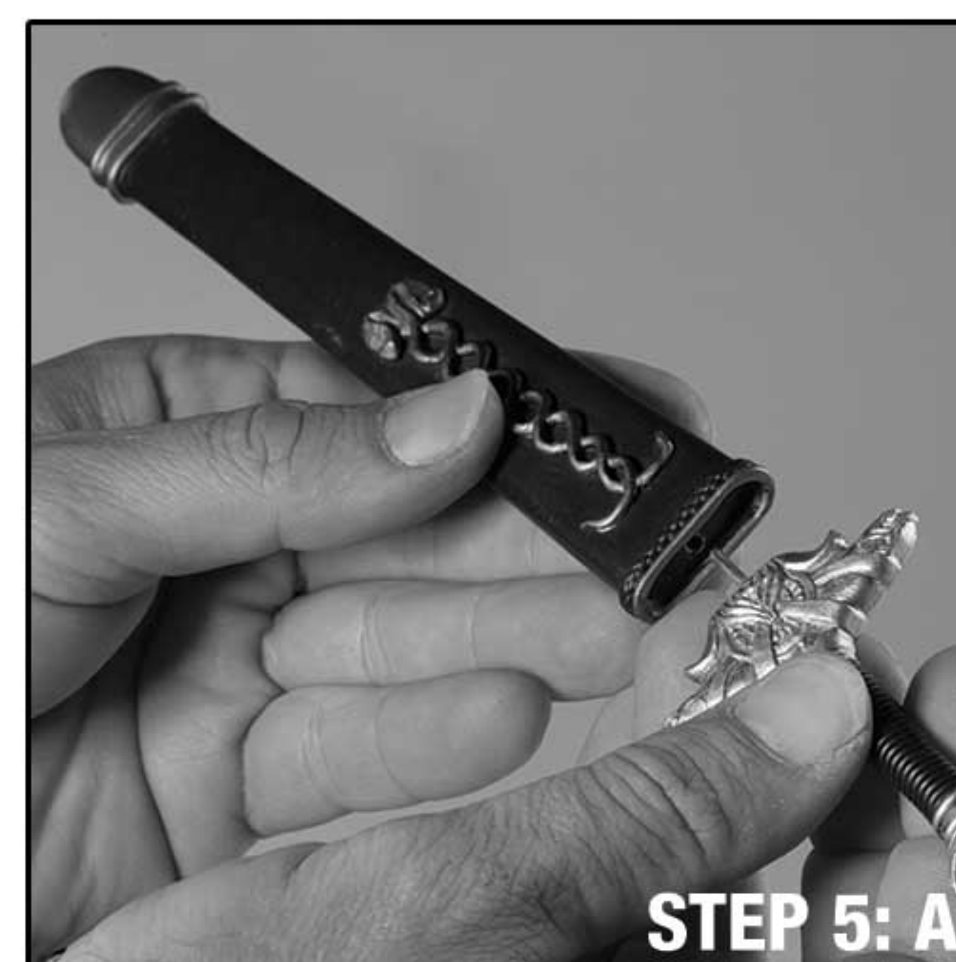
STEP 5: A

STEP 4: Attach the arm of the skeleton body into the outside shoulder socket key hole.