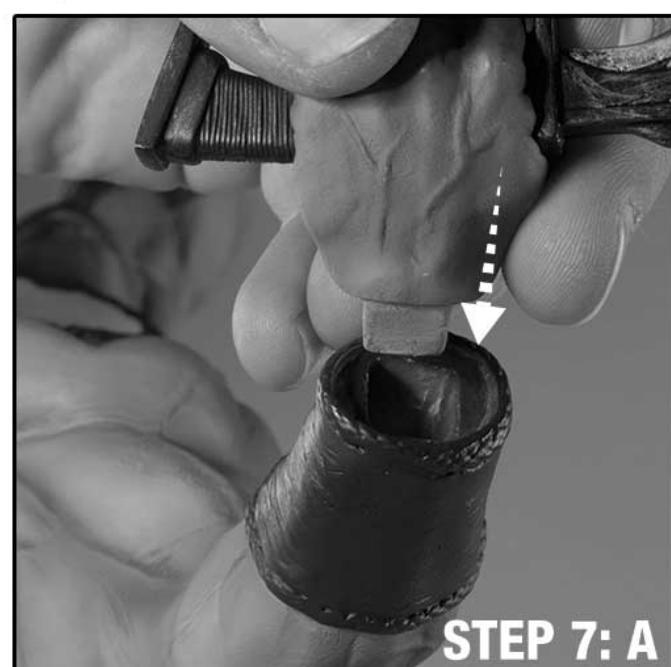
STEP 7: A