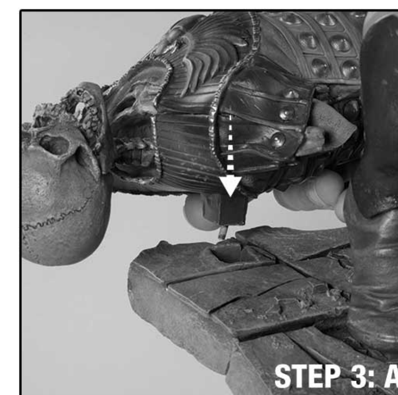
STEP 3: A

STEP 2: Place column piece on base aligning key with key hole.