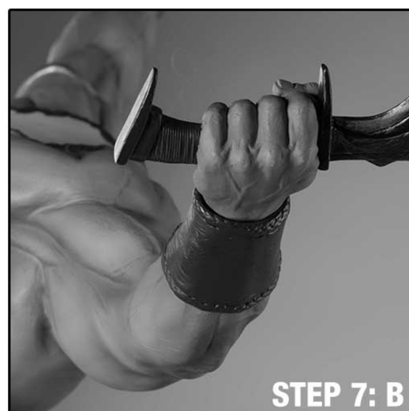
STEP 7: B

STEP 7: Attach figure's left hand with Khopesh Blade.