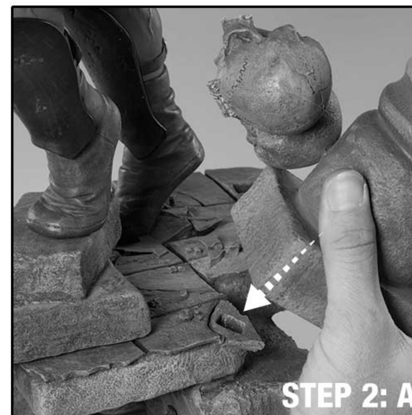
STEP 2: A

STEP 1: Place figure onto base aligning foot keys into corresponding key holes.