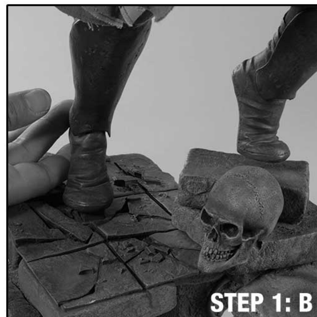
STEP 1: B

STEP 1: Place figure onto base aligning foot keys into corresponding key holes.