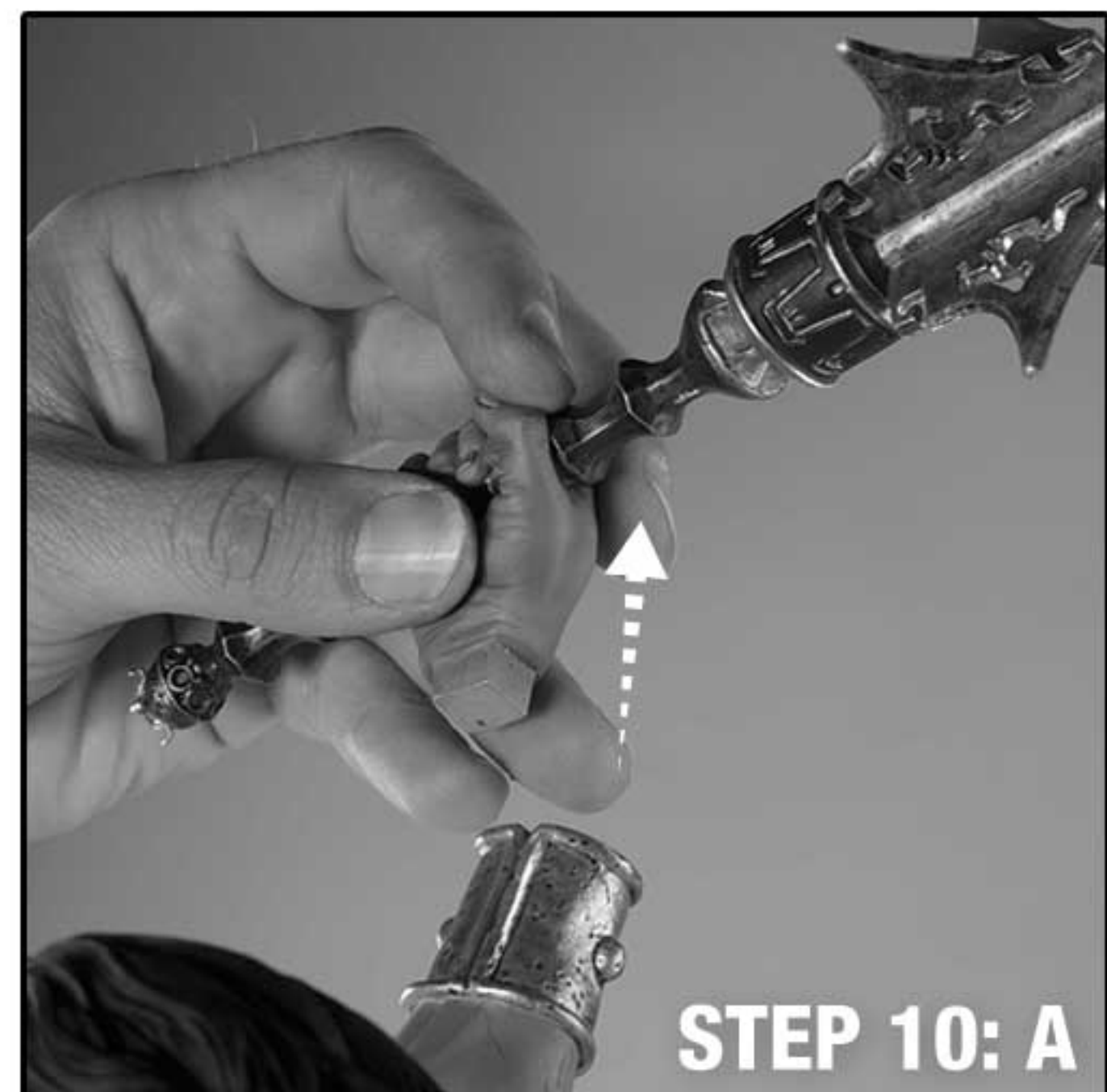
STEP 10: A