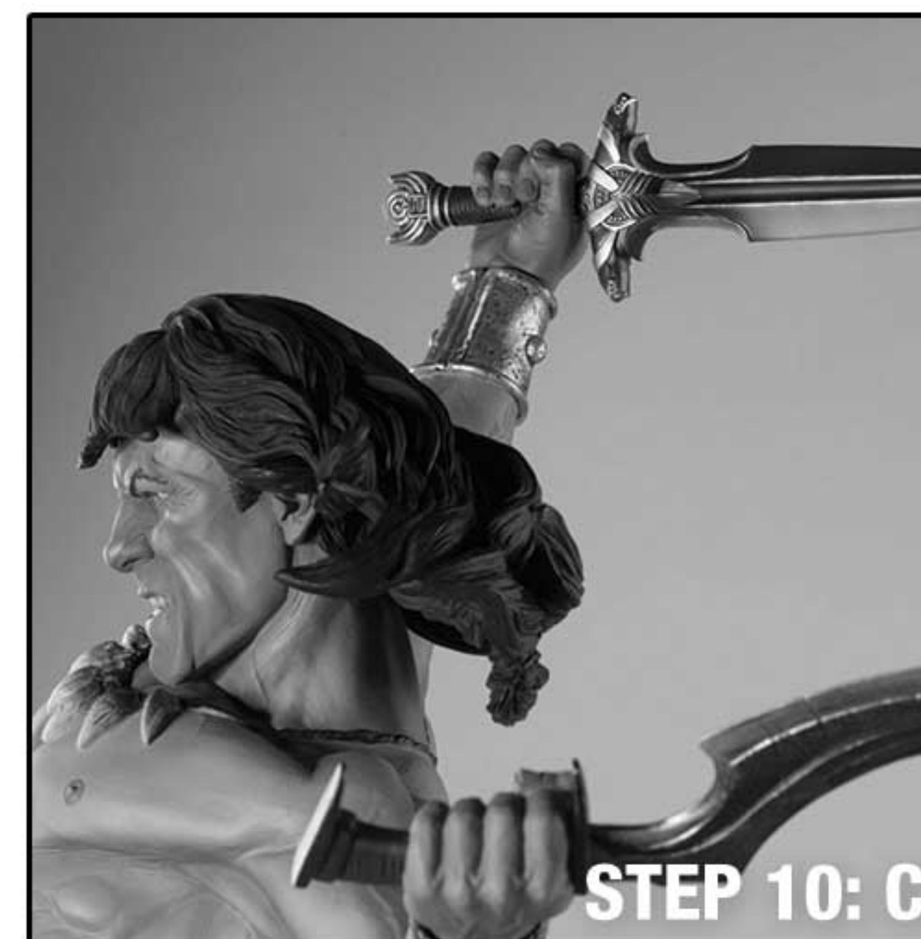
STEP 10: C

STEP 10: For exclusive display, remove right hand with mace and insert hand holding the Atlantean sword.