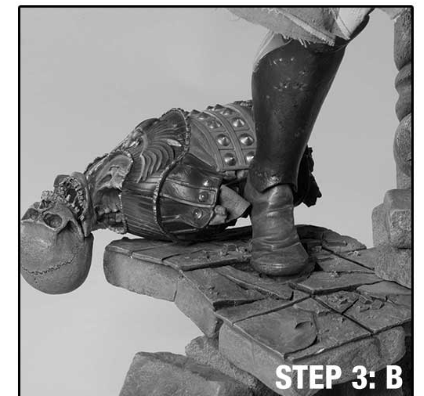
STEP 3: B

STEP 3: Place skeleton body onto the base aligning the back key with the base key hole behind Conan's right foot.