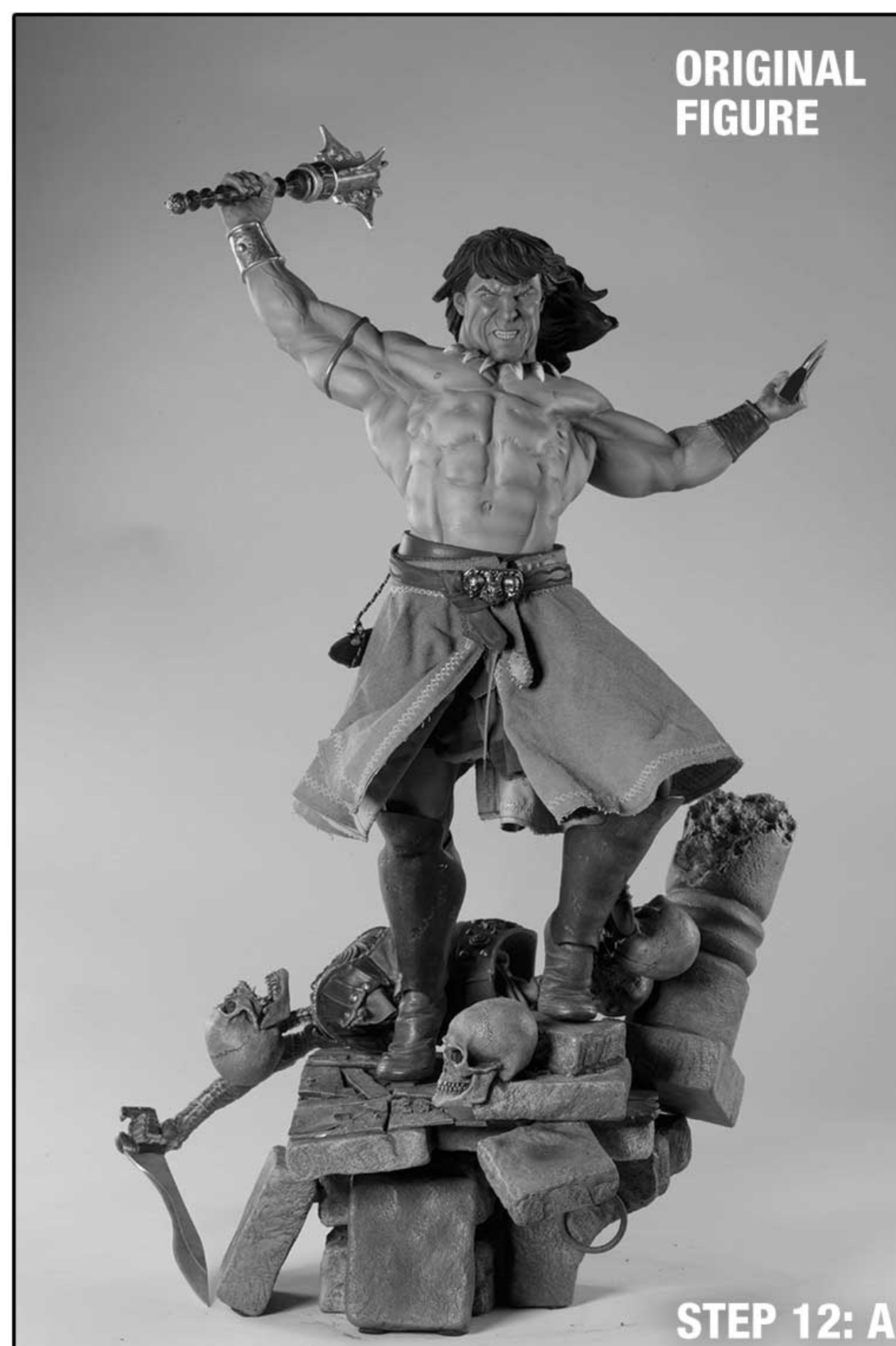
STEP 12: A

STEP 11: For exclusive display, remove Atlantean sword handle from its sheath.