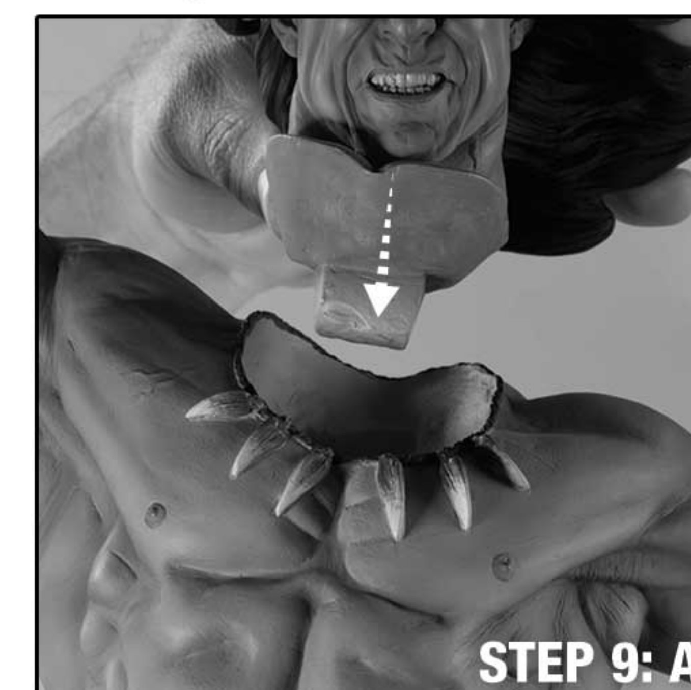
STEP 9: A

STEP 8: Attach figure's right hand with Mace.