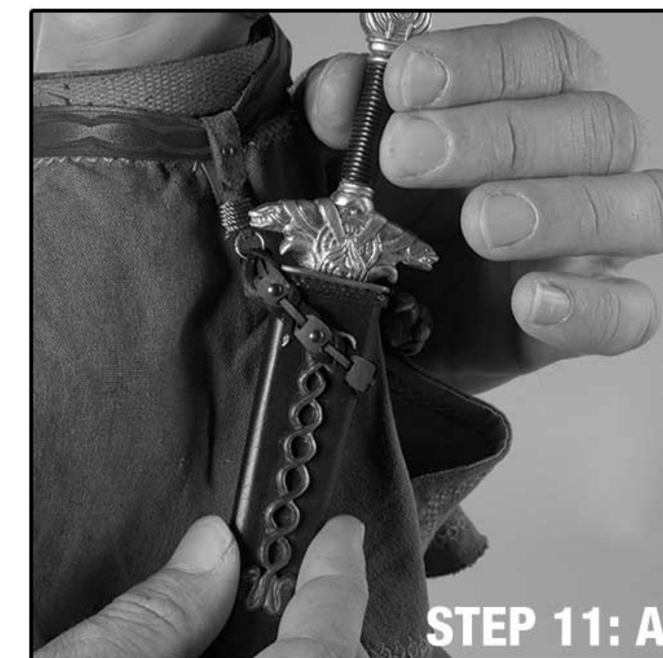
STEP 11: A

STEP 10: For exclusive display, remove right hand with mace and insert hand holding the Atlantean sword.