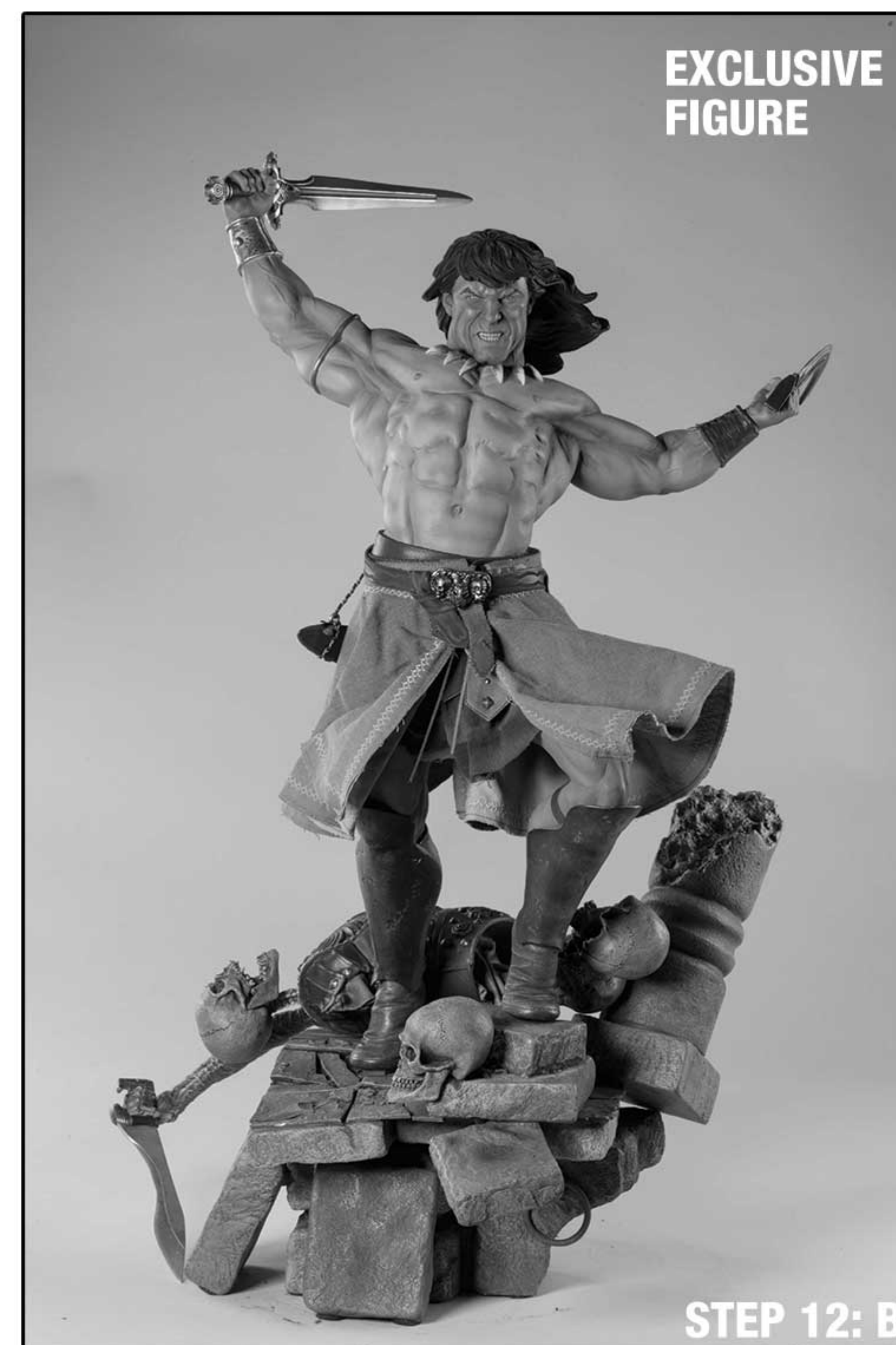
STEP 12: B