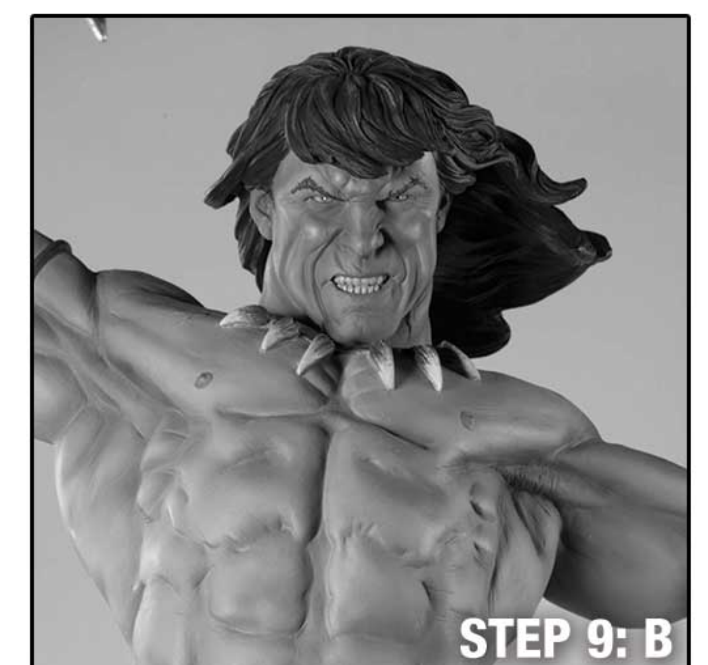
STEP 9: B

STEP 9: Attach figure's head to the top of the figure's body.