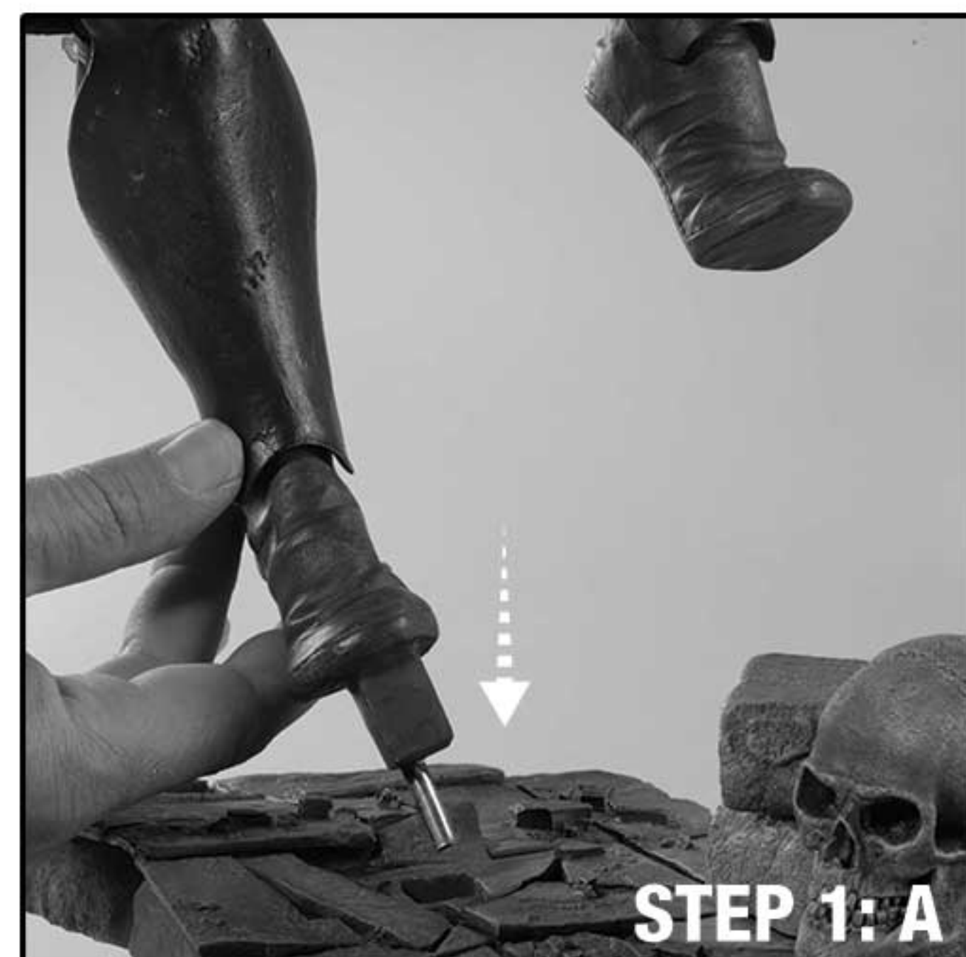
STEP 1: A