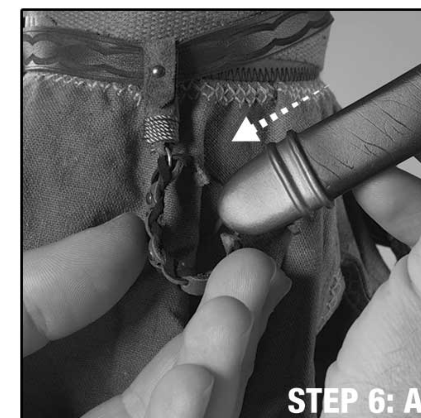
STEP 6: A

STEP 5: Insert Atlantean sword handle into the sheath.