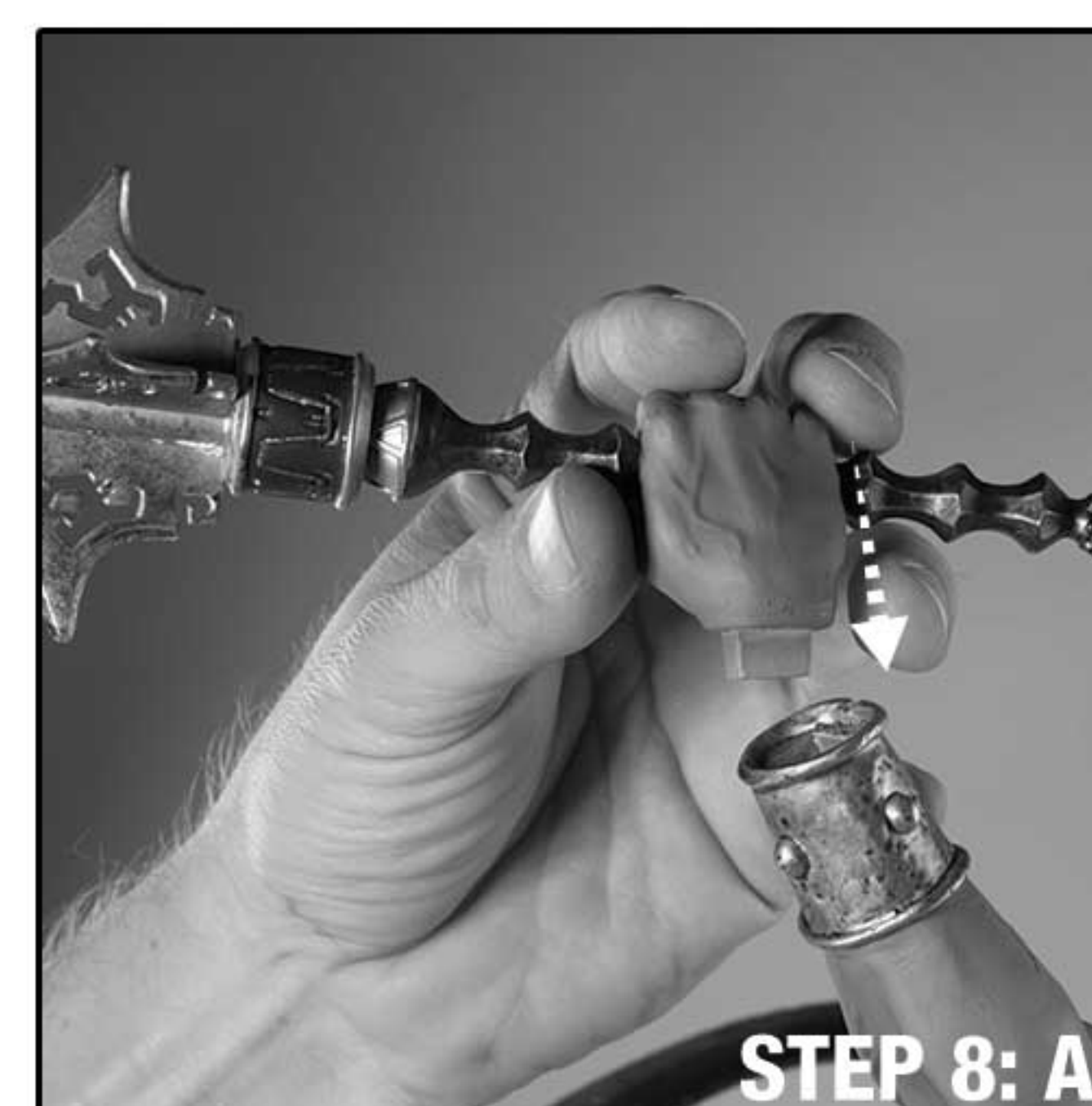
STEP 8: A

STEP 7: Attach figure's left hand with Khopesh Blade.