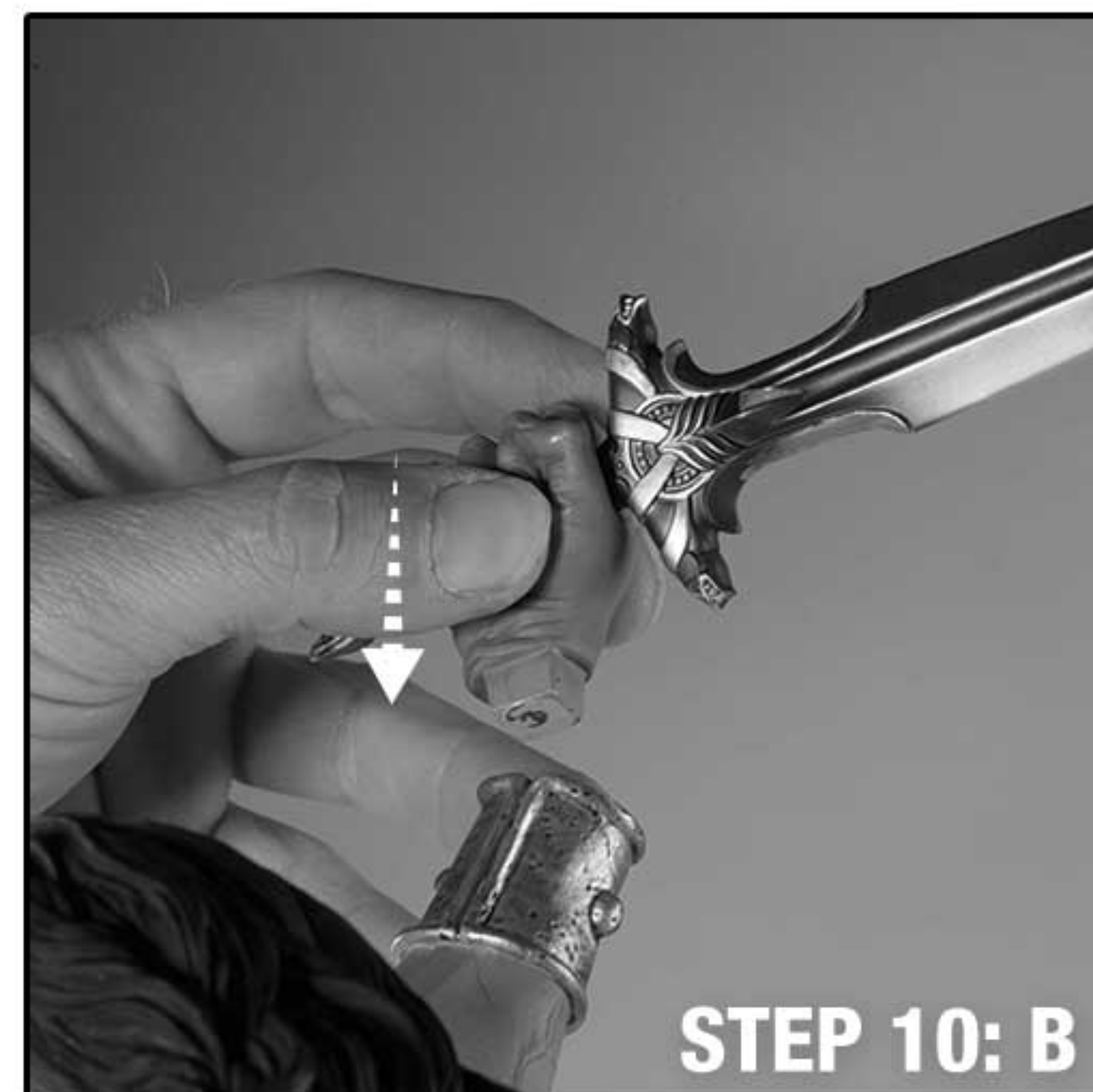
STEP 10: B