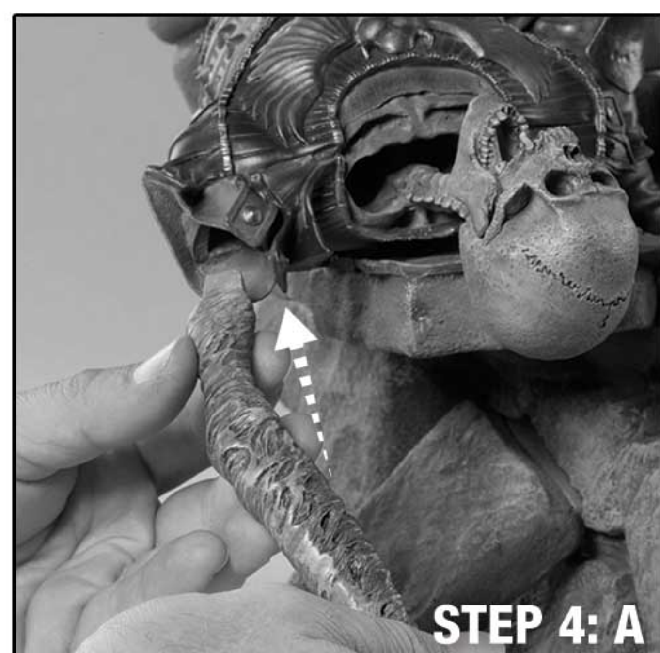
STEP 4: A